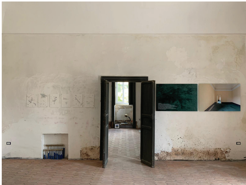
Dislocamento, 2021, Villa Iblea Exhibition, Modica, IT