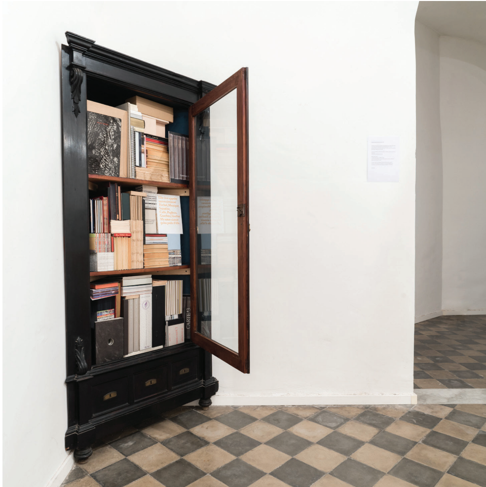
Koobook–Deconstruction of the Archive, 2019, Books and archive files, fanzines, catalogs, 230x70x60 cm

Man Ray was once invited to write of himself and his readymade and he left a text from which I borrow a quotation that I think in some ways is valid as a key to my work too.