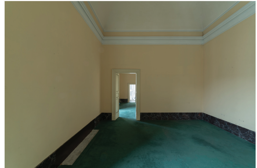
Displacement #1-2, 2021, Print on paper, Hahnemühle Photo Rag mounted on Dibond, 140x105 cm, Diptych