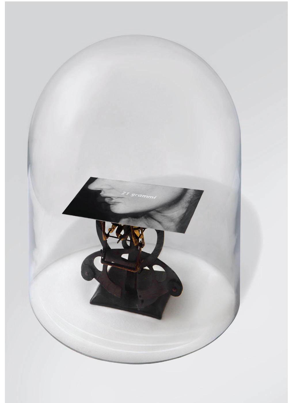
21 Grams, 2017, Photo, letter scale, glass bell